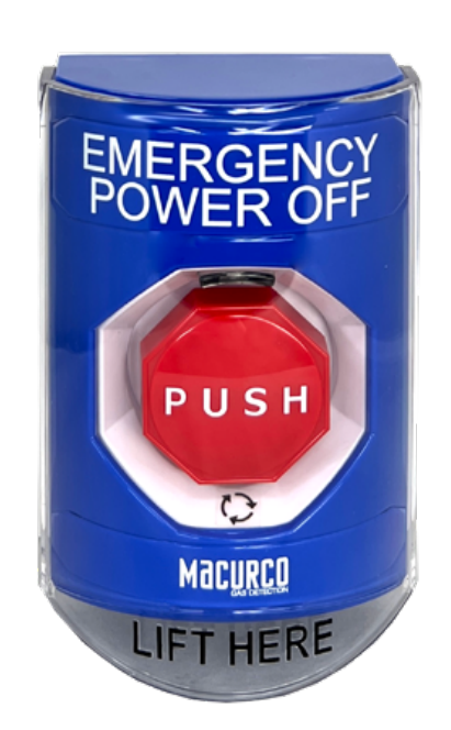
Emergency Power Off